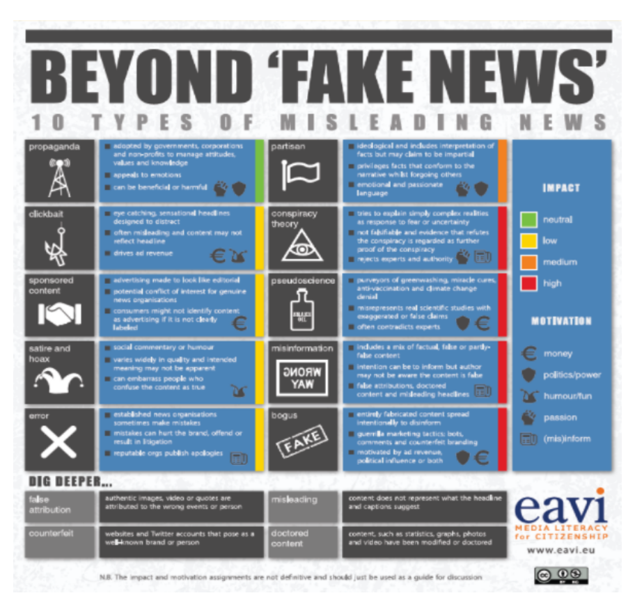
Infographic: "Beyond Fake News".

Check the "Beyond 'Fake News' - 10 types of misleading news"